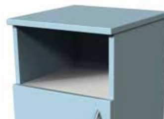
Optional: Colour contrast for fixed shelf