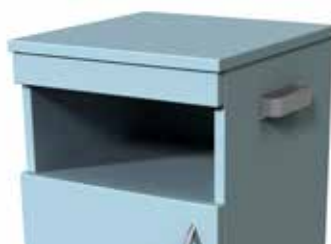
Optional: Accessory bar holder