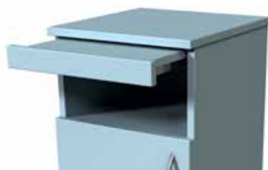
Optional: Sliding tray