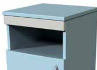
Optional: Fixed strip with optional colour contrast