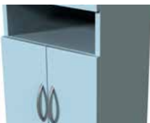
Optional: Two half doors