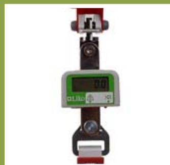
LikoScale with Quick-release adapter