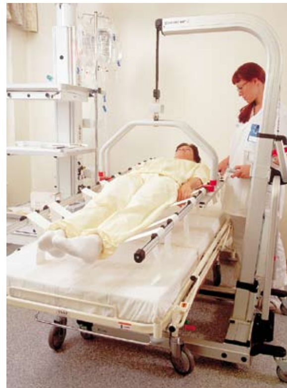
LikoStretch 600 IC

Designed for the heaviest lifting situations with the patient in a horizontal position. Lift sheet or lift straps are optional accessories. A Stretch Leveller is part of FlexoStretch.