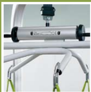
Stretcher with Stretch Leveller